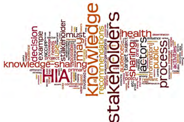
Image: generated on the site www.wordle.net with NCCHPP text.