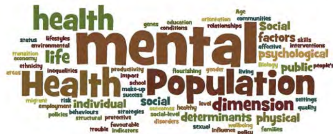
Image: generated on the site www.wordle.net with NCCHPP text.